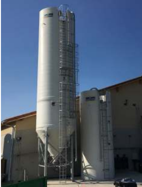
Legged and Skirted silos: